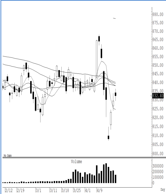
S50M24 (Close 832.40 Chg 3.0)